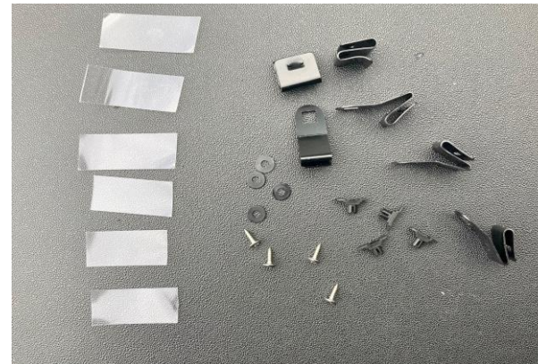
Complete fitting kit