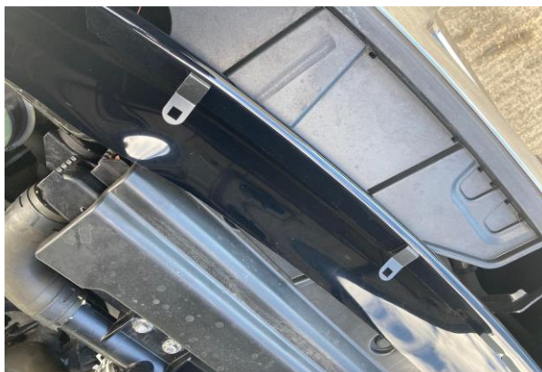
Attach fitting bracket