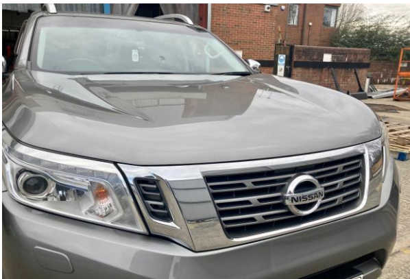
Nissan Navara NP300 2016-onwards