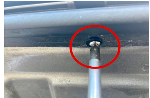
Insert and tighten the four screws