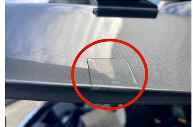
With bonnet guard aligned, attach self adhesive protection tape