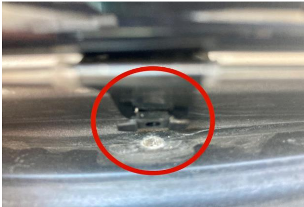
Insert four plastic plugs through the square hole into existing hole in bonnet