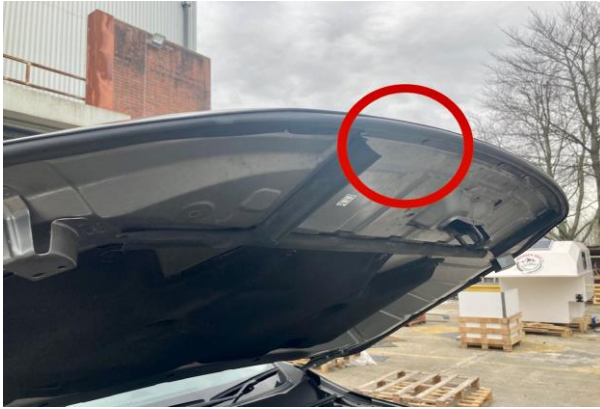
Align bonnet guard to show the four plastic clips to remove